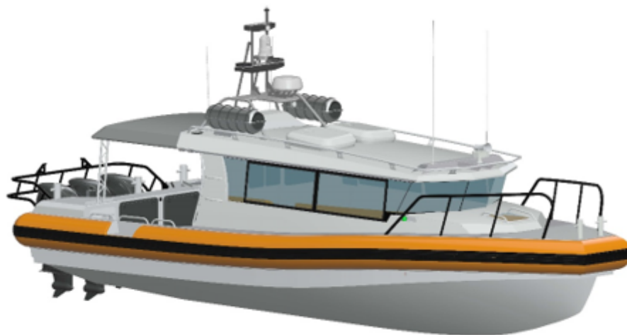
Above picture: 3D model of VMR Thursday Island