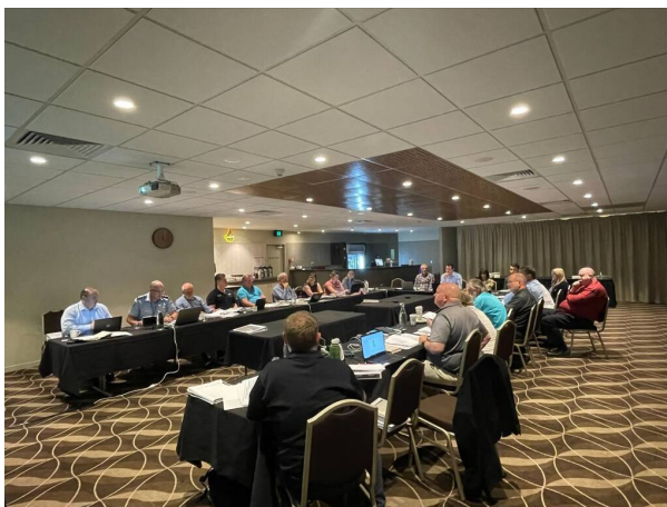
Photos: The Marine Rescue Implementation Working Group meeting on 23 November 2021.